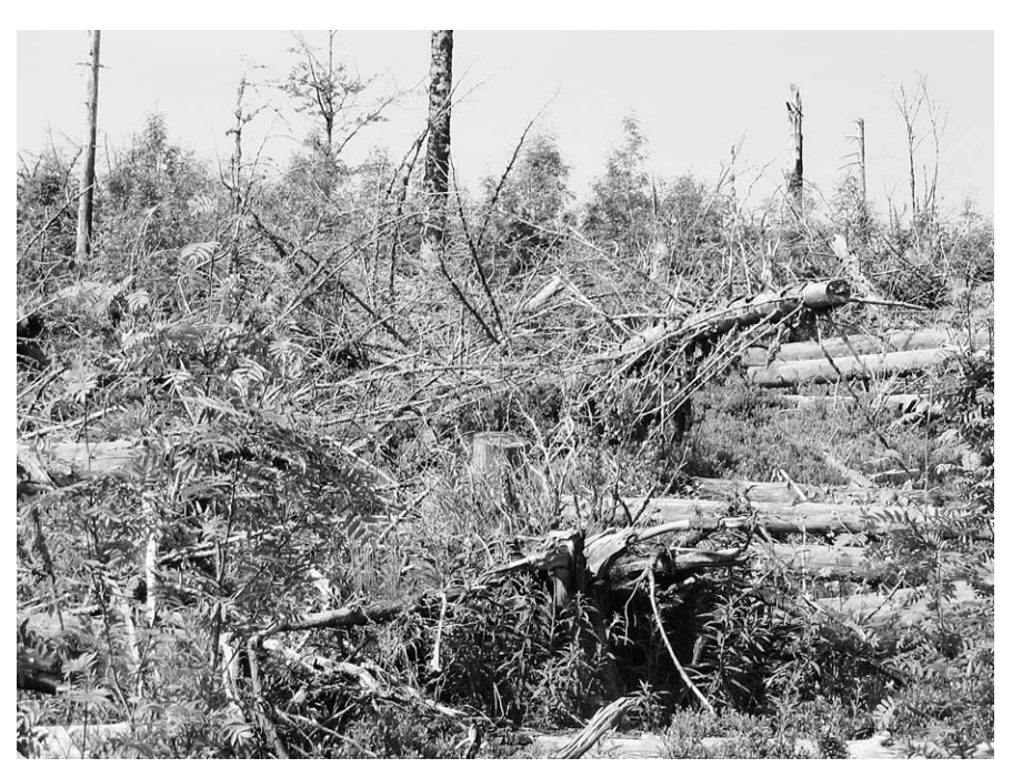
FIGURE 1 Dynamics of natural reforestation along the "Lothar" trail in the Black Forest, Germany: within a few years of the devastating 1999 storm, young trees could be seen thriving between the dead wood left lying on the ground.

Because a storm-devastated forest area can only be observed safely from a distance, an adventure trail had to be constructed to make the area accessible to the general public. This trail now provides thrilling insight in the form of a fixed rope route, leading over and under fallen trees. By contrast with the still very