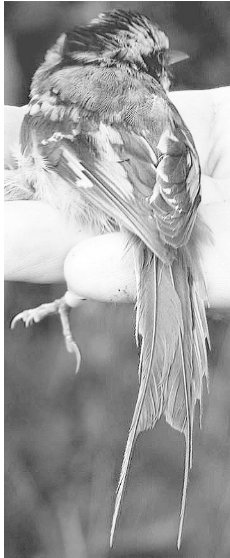
FIGURE 1. Thorn-tailed Rayadito with its characteristic graduated tail.

Switzerland) spring balance to the nearest 0.1 g. As all individuals were captured in the same nesting stage, it was not necessary to control for stage-dependent mass changes. A drop of blood was obtained by brachial venipuncture, and blood was stored in a buffer solution (100 mM of Trishydroxymethylaminomethane [TRIS] pH = 8.0, 100 mM of Ethylenediaminetetraacetic acid [EDTA] and 2% Sodium Dodecyl Sulfate [SDS]) for DNA preservation until analysis. The exact age was known for only