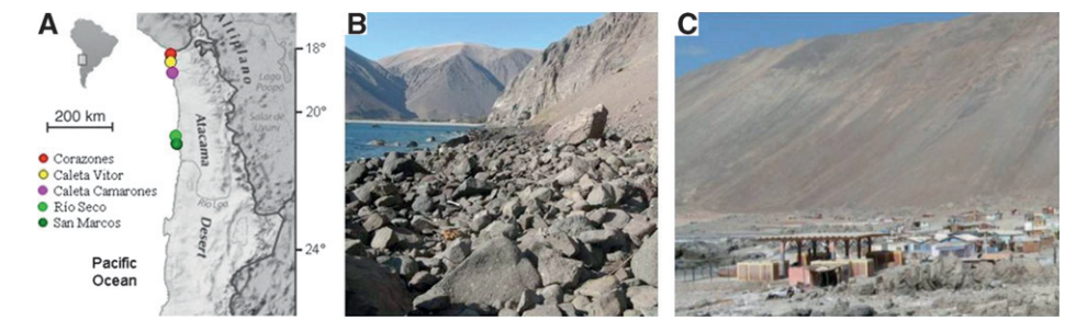
FIGURE 1. A, Map of northern Chile showing triatomine collection localities. B, Caleta Vitor (locality in ecotope 1). Note the presence of abundant stony areas and the absence of sand. C, San Marcos (locality in ecotope 2). Note the abundant stony area. Several fishermen's dwellings are seen.