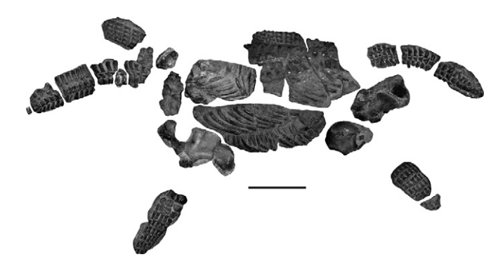
Fig. 2. SGO.PV.260, Aristonectes sp., postcranial skeleton of sub-adult individual. Scale bar represents 50 cm. Modified from Otero et al. (2012).

Specimens utilized for measurements and bivariate graphic analysis.