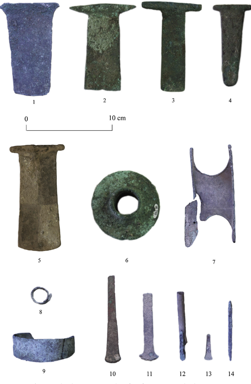
Fig. 6. Local and exogenous metal artefacts from MH San Pedro de Atacama.

We also found unalloyed copper among the objects studied (24%). Its presence is particularly interesting because this is very unusual in metallurgical traditions both in the Bolivian altiplano and northwestern Argentina during this period. We believe this was a local metallurgical tradition coexisting with imported metal artifacts. That unalloyed copper was made locally is corroborated by its presence in Late Formative sites (Figueroa et al., 2010), and especially the presence of metallic prills and metal fragments of unalloyed copper found in tombs from M SPA, as well as on the surface of some sites dated to this period (Cifuentes, 2013; Salazar et al., 2011). Unalloyed copper was mainly used to manufacture domestic instruments such as chisels and awls, but also some prestige items have been found such as T-axes and circular mazes which resemble those stone artifacts used to signal political power in the local community during the Late Formative Period and the MH (Llagostera, 1996, 2006a, 2006b).