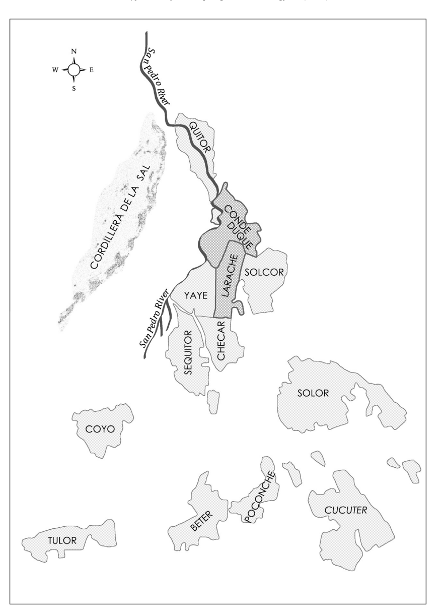
Fig. 2. San Pedro de Atacama's ayllus.

have been as direct as previously suspected, since they may have been mediated by secondary centers such as Cochabamba (Uribe and Agüero, 2001) or Potosí-Chuquisaca (Thomas et al., 1985). The active role of local communities in the interaction between SPA and Tiwanaku has also been increasingly considered. This latter shift in the understanding of the period is mostly the outcome of new theoretical approaches to the political organization of Tiwanaku (i.e. Albarracín-Jordán, 1996; Goldstein, 2007; Janusek, 2004; Stanish, 2002) and the understanding of colonial interactions (Stein, 2002), as well as the recognition of identity as a political construction (Berenguer, 1994; Stovel, 2002, 2005). The latter approach was pioneered in SPA by Uribe and Agüero (2001, 2004; see also Berenguer and Dauelsberg, 1989) and has received important support from contributions by Stovel (2001, 2002, 2005) and more recently by Torres-Rouff (2008) and Nado et al. (2012) from a bioarchaeological perspective.