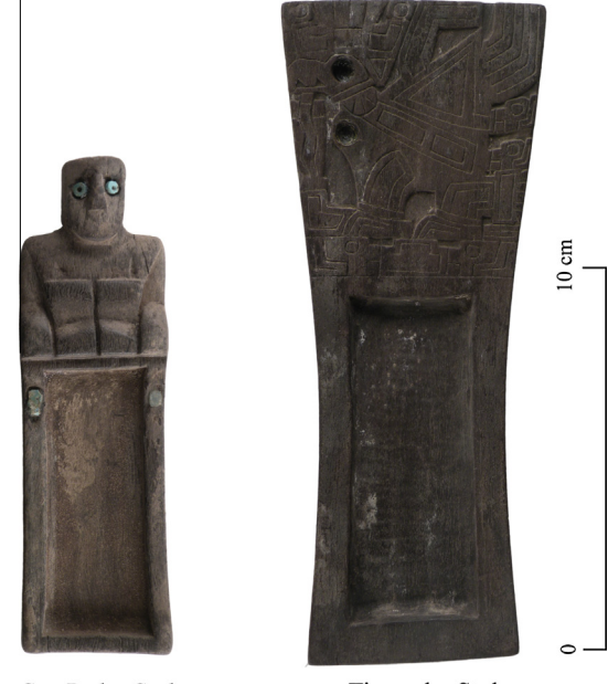
San Pedro Style

Occurrence of snuff trays in the Circumpuneño style is restricted to the Late Intermediate Period, according to material associations within the tombs. However, it is noteworthy that during the MH and maybe even since the Late Formative Period, San Pedro style trays coexist with Tiwanaku style trays (Fig. 5). The latter also coexist with snuffing tubes in the Tiwanaku style. Given that we have considered the San Pedro style of a local nature (Horta, submitted for publication), we suggest members of the local community of SPA were manufacturing their own snuffing trays and, what is even more important, they were decorating some of them with a local iconography early in the development of this mode of consumption of hallucinogens. Trays with Tiwanaku iconography continue to appear in the archaeological record, most likely imported as an item of prestige (Llagostera, 2006b). We may conclude that at the same time that Tiwanaku trays were imported