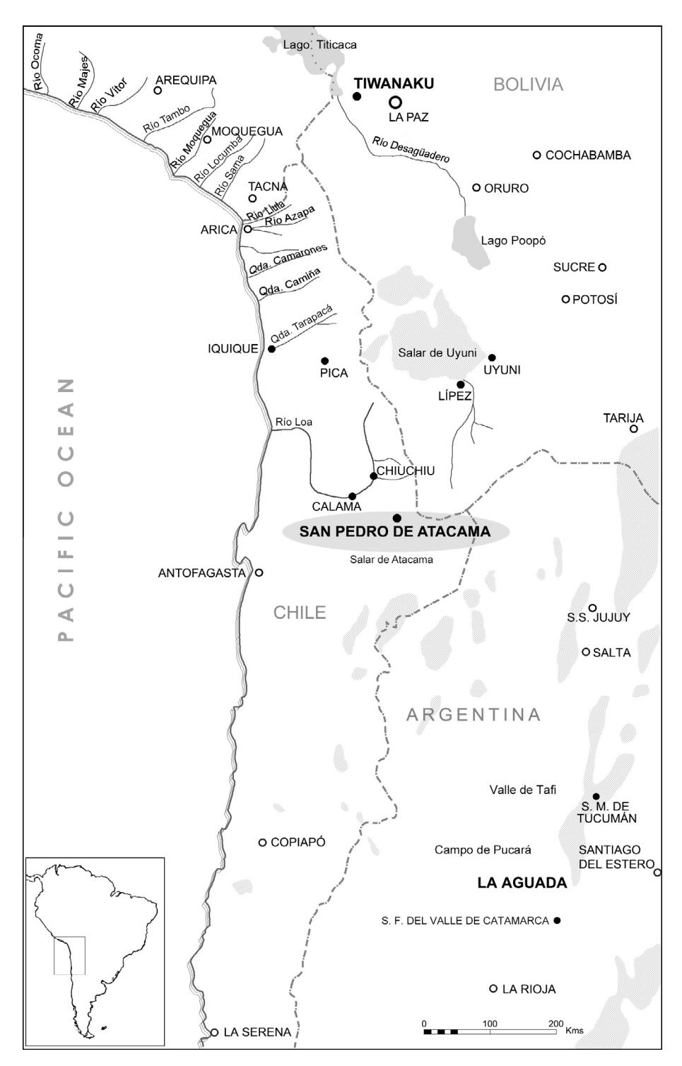
Fig. 1. Map of northern Chile and San Pedro de Atacama.

ideological/political expansion of the first South-Andean state: Tiwanaku.