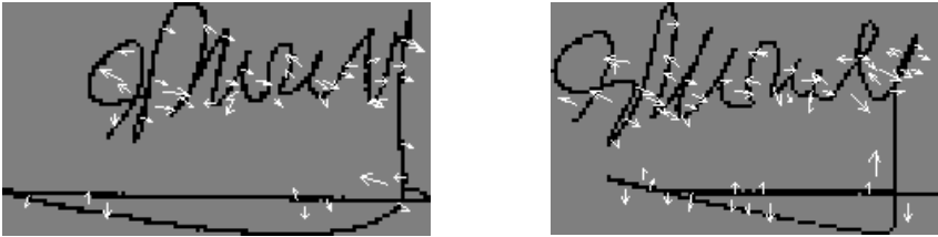
Fig. 1. Example of detected local interest points in a pair of test and template signature images. Interest points are displayed as arrows, whose origin, orientation and size corresponds to the position (x,y) , orientation \theta and scale s of the corresponding interest points.

This article is structured as follows. In section 2 the employed methodology for solving the general wide-baseline matching problem is described. In section 3 the adaptation of this methodology to signature verification is presented. In section 4 preliminary results of this new approach for signature verification are presented. Finally, in section 5 some conclusions and projections of this work are given.