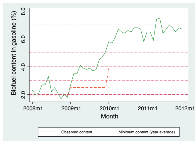
Fig. 1. Observed and minimum required biofuel content in gasoline (%).

Gasoline consumption is expressed in tons and includes the consumption of 95 octane and 98 octane fuel. We also have information on the average monthly price of 95 octane gasoline per province (expressed as cents of one Euro per liter) for the same period. 11 These prices have been deflated by the consumer price index of each province. Since retail gasoline prices may be endogenous, some of the models presented below are estimated by instrumental variables. We use the international price of oil (Europe Brent Spot price FOB in U.S. dollars per barrel taken from the U.S. Energy Information Administration database) and the Euro-Dollar exchange rate (from the European Central Bank) to instrument the retail price of gasoline in these estimations.