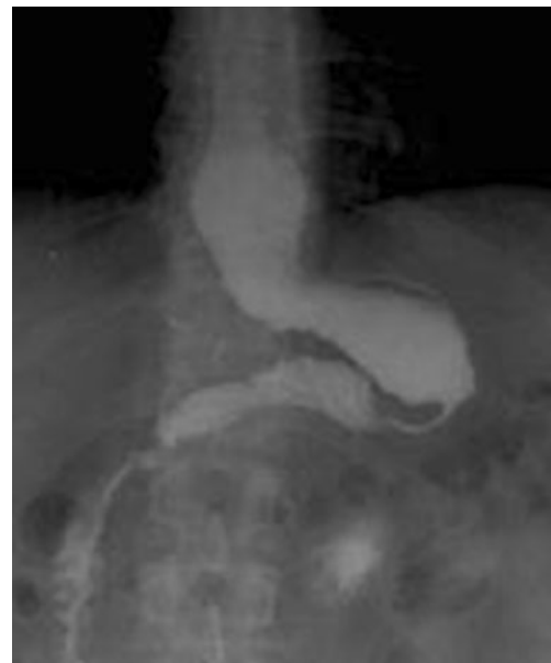
Fig. 4 A 34-year-old man with stenosis 24 days after LSG. Two endoscopic dilatations were carried out and laparoscopic RYGBP was performed afterwards

Symptoms of stenosis are difficulty in the passage of food through the gastric lumen, with regurgitation of retained food, vomiting, persistent nausea, and even high-grade dysphagia manifested by sialorrhea. These symptoms must be differentiated from gastroesophageal reflux symptoms such as regurgitation and heartburn. Braghetto et al. suggested that LSG modifies the anatomy of the esophagogastric junction and produces an important decrease in lower esophageal sphincter pressure, which, in turn, can cause the appearance of reflux symptoms and esophagitis after the operation due to a partial resection of the sling fibers during gastrectomy [18, 19]. On the other hand, few authors believe that LSG has a beneficial effect on reflux [20, 21]. Further systematic literature reviews about the impact of LSG on gastroesophageal reflux disease report evidence that does not consolidate to a consensus [22]. We believe that it is important to differentiate regurgitation in a patient with gastroesophageal reflux, produced or related to