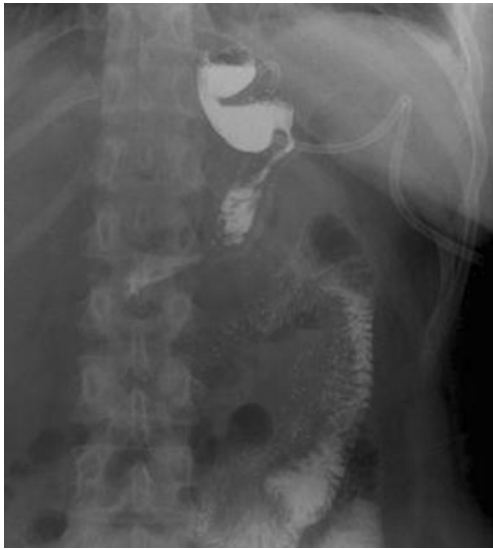
Fig. 1 Barium upper gastrointestinal contrast study demonstrating a dilated upper part of the sleeve with an immediate narrow passage to the lower part

placed over the staple line, a bougie size that is too small, or hematomas and edema [14, 15]. In our series, in two of the five patients, the staple line had been oversewn, and a bougie 32 F was used only in one of them. We have not sutured, in any case, the omentum with a running suture.