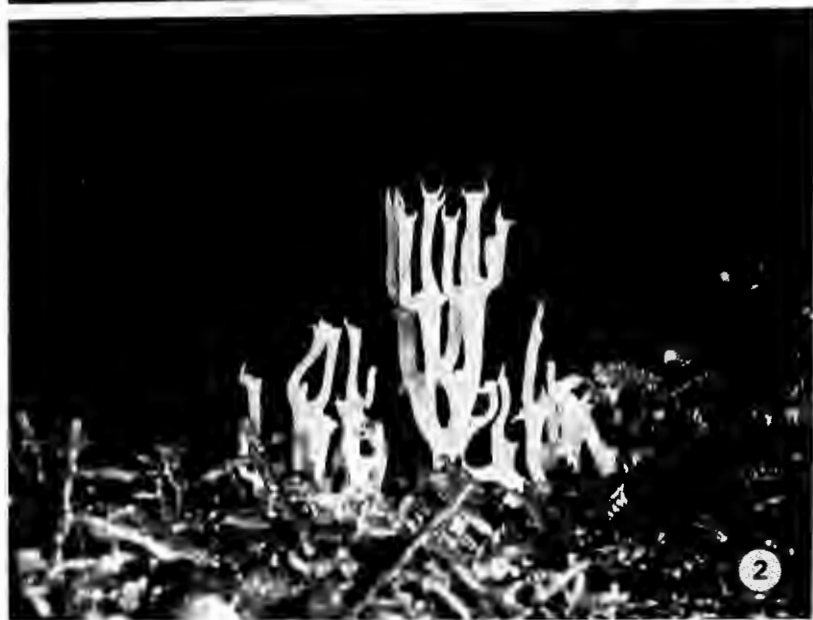
FIG. 1. Clavaria pumanquensis , \times 6/7 FIG. 2. Clavicornora turgida , \times 2