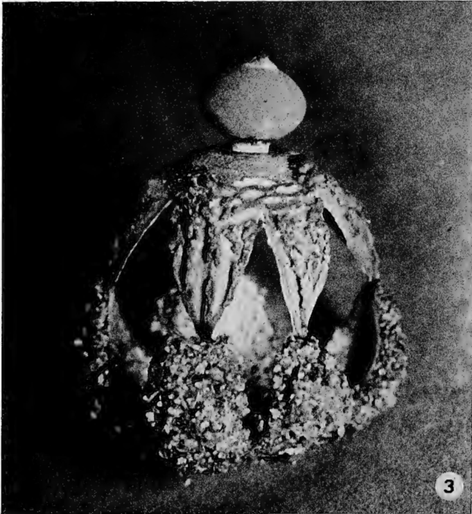
FIG. 3. Geastrum jurei , \times 21 .