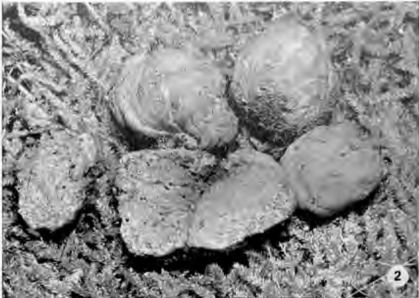
FIG. 1. Setchelliogaster tenuipes , \times 1 .