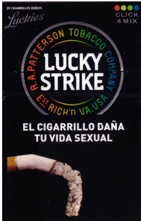
Figure 3. Example of flavour capsule cigarette pack that includes four different flavors, including. Red Sense, Lemongrass, Mint and Blue Touch.