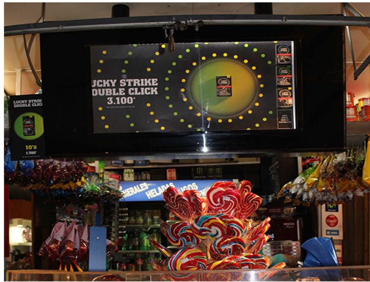
Figure 2. Flavour capsule pack display at point of sale in Chile, 2014.