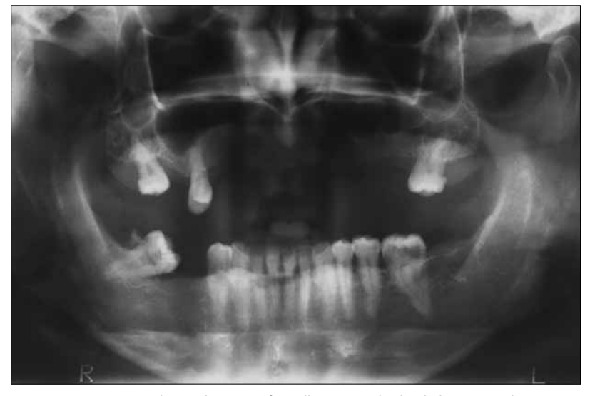
Figure 1. Panoramic radiographic view of a well circumscribed radiolucency in the anterior maxilla; a presumptive diagnosis of residual cyst was made