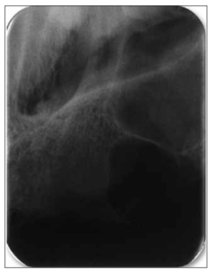
Figure 2. Detail of the radiolucent lesion, which extends to the cortical alveolar process