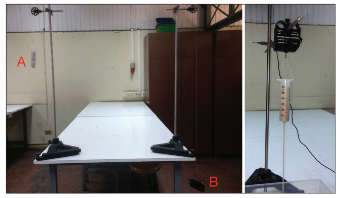
Fig. 1. Left: Experimental setup of the variable mass Atwood's machine. Right: Discharging flow of sand experimental setup. A PASCO Force Sensor was positioned at the top to collect the data.

The experimental setup is shown to the left of Fig. 1. Two pulleys were located at the top. A negligible mass string was attached to it. A syringe (filled with sand) was added on the side of the string (position A in Fig. 1 left), which mimics our variable mass. On the other side of the string, a smartphone (iPhone 5) was attached (position B in Fig. 1 left). The "Vernier data acquisition"<sup>7</sup> program was used to collect the data over a certain period of time.