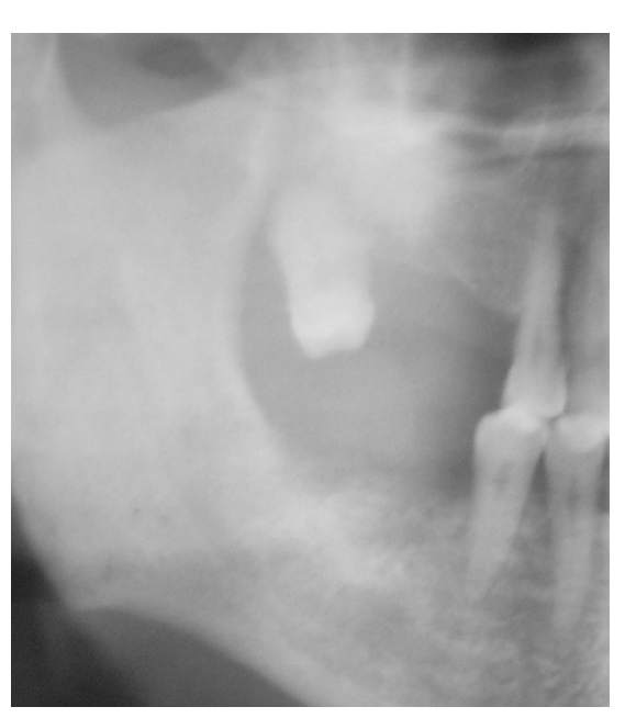
Fig. 2. Orthopantomography. Irregular osseous rim with areas of recent osteitis in relation to the tooth 4.7.