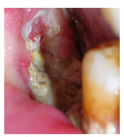
Fig. 1. Clinical aspect of the intraoral lesion. Osseous tissue lesion exposed to the oral cavity.