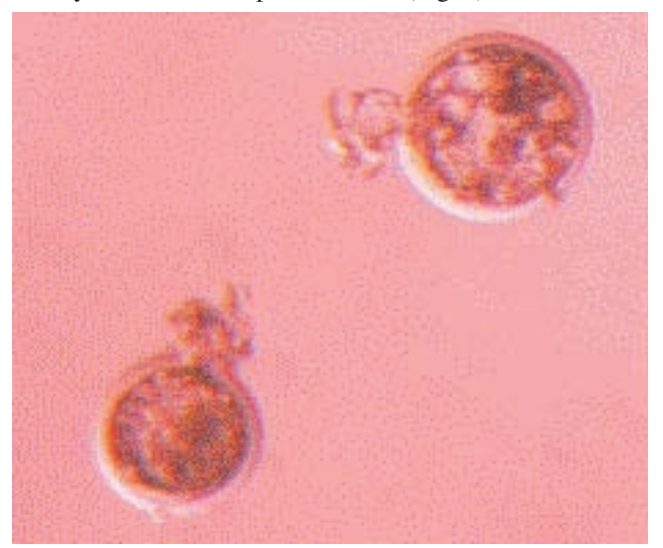
Fig. 2. On the seventh day a blastocyst hacht from the pellucid zone. 1000 \ \mathrm{X}

In respect to the timetable, we have observed that a stage of two blastomers is reached on the second day, and morulae of 8 to 16 cells on the third day. On the fourth day it has differenciated as a blastocyst and on the seventh day it finally hacht from the pellucid zone (Fig. 2).