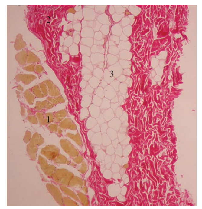
Fig. 2. Longitudinal section of the muscle fascia stained with the van Gieson technique, 10x. It highlights the skeletal striated muscle fibers (1), fibers of collagen I (2), and adipose tissue (3). Here we see the face of the fascia muscle.

unstained, colorless cytoplasm); more deeply, the insertions of the striated muscle fibers (bright yellow) and the endomysium -in continuity with the fascia itself- can be noticed. Micrographs show that the striated muscle fibers are inserted laterally and at different levels into the dense connective tissue. Connective tissue also has abundant vascular irrigation.