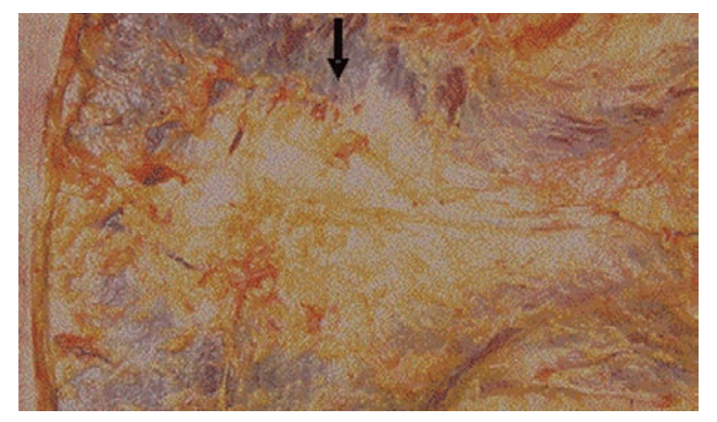
Fig. 1. Result of dissection by planes of the relationship between superficial fascia and the trapezius muscle (arrow).

In Figures 2, 3 and 4 show the Van Gieson staining of the biopsy of the external fascia of the trapezius. It can be noted, from surface to deep, the provision of irregular dense connective tissue (red) with abundant fatty tissue (cells with