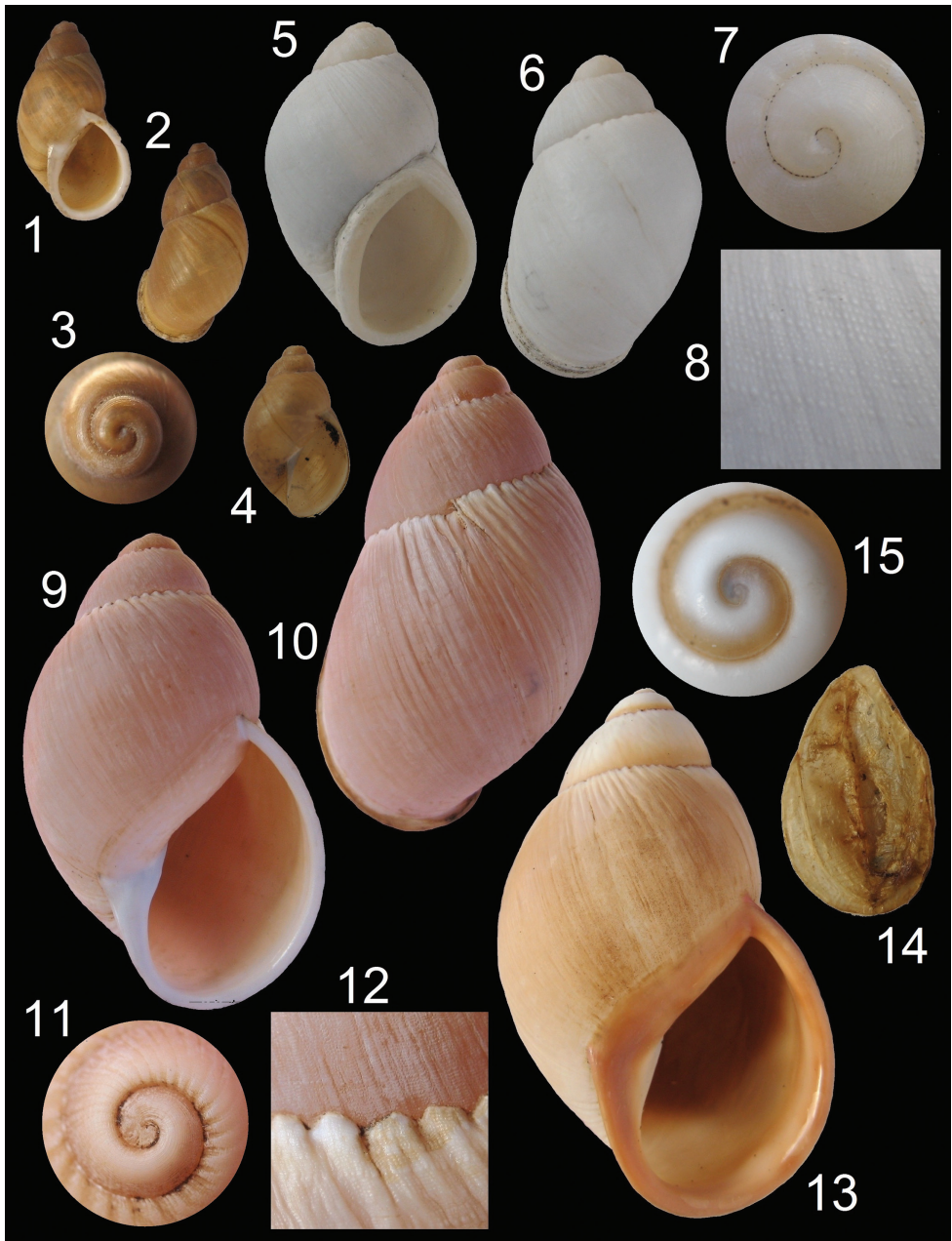
Figure 2. Chiliborus shells. Chiliborus bridgesii , Pajonales Bay, Province of Copiapó, 20.3 mm: 1 Ventral view 2 Dorsal view 3 Detail of protoconch 4 Juvenile shell. Chiliborus pachyphilus , Chañaral de Aceituno, Province of Huasco, 37.3 mm: 5 Ventral view 6 Dorsal view 7 Detail of protoconch 8 Detail of sculpture. Chiliborus rosaceus , Los Molles, Valparaiso Region, 61.9 mm: 9 Ventral view 10 Dorsal view 11 Detail of protoconch 12 Detail of suture and sculpture 13 Ventral view of an orangish specimen, Pichidanguí, Valparaiso Region, 74.5 mm 14 Preserved epiphragm 15 Detail of protoconch.