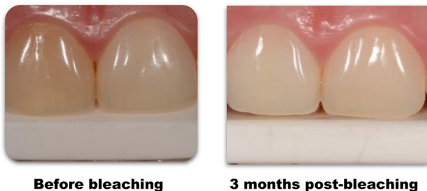
Fig. 2 Case that represents an ideal case of matching the color with a bleaching non-vital technique

change obtained with the walking bleaching technique and equalization with the homologous and neighboring teeth.