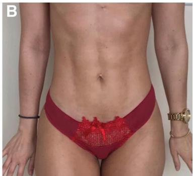
Fig. 3. A 33-year-old female patient classified as "6-pack" and Matarasso type 1 (body mass index = 21.3 \text{ kg/m}^2 ) undergoing high-definition liposuction with UGRAFT. Thirty milliliter of fat was injected into each of the inferior and middle "packs." A, Preoperative view. B, Postoperative view.

Comparing the rectus abdominis muscle thickness pre-UGRAFT (mean, 1.15\,\text{cm} ) and post-UGRAFT (mean, 1.70\,\text{mm} ), we observed an average muscle thickness increase of 5.1\,\text{mm} ( 55.7\% \pm 37\% ), P < 0.0001. No complications were observed in this series.