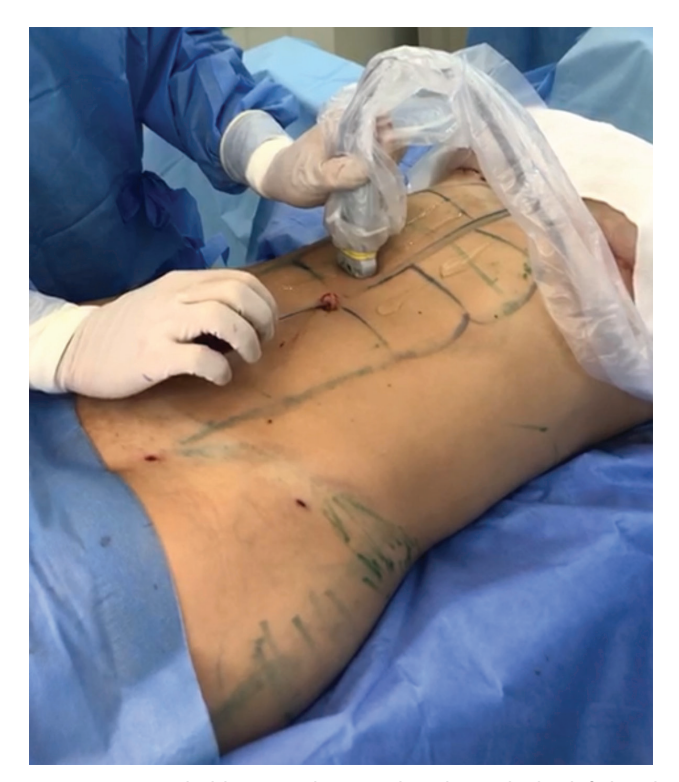
Fig. 1. Surgeon holding an ultrasound probe with the left hand and a cannula with the right hand to perform UGRAFT. The cannula is introduced by an incision in the umbilical region and carefully guided by an ultrasound image until it penetrates the rectus abdominis sheath.

patients undergoing UGRAFT was conducted. Inclusion criteria were Matarasso type 1 patients ^7 without skin laxity, body mass index (BMI) <26\,\mathrm{kg/m^2} for women, and BMI <28\,\mathrm{kg/m^2} for men. Exclusion criteria were presence of skin laxity and age \le18 or \ge60 years.