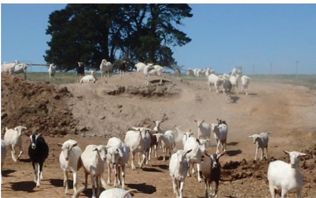
Figure 3. A dairy goats herd composed by Alpine and Saanen animals, which are raised in a semi-intensive production system.

Dairy cattle are the main milk producing species in South America, but sheep, goats, and buffaloes are also raised for similar purposes. Milk production in South American countries are mainly characterized by pasture-based production systems. However, an intensification trend has been observed after the inclusion of several large dairy operations, characterized by advances in nutrition and management practices. Girolando, a composite dairy breed developed in Brazil by crossing Holstein and Gyr cattle, is the main genetic resource used for milk production in the tropical regions of Brazil ( Canaza-Cayo et al., 2018 ). Dairy goats (especially Alpine and Saanen breeds; Figure 3 ) have, to a lesser extent, economic importance in certain regions of South America, including the Northeast and Southeast of Brazil. Buffaloes are also raised for milk production (and cheese-making), especially in the Southeast and North of Brazil, Bolivia and Colombia. There are some dairy sheep producers, mainly in Argentina, Uruguay, Chile, and