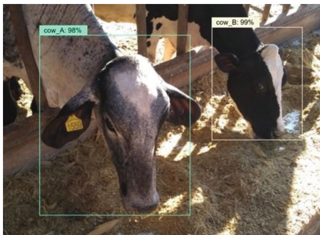
Figure 4. An example of computer vision use (pilot project) in which two cows were video identified with high similarity after an automated search in the image database. After identifying the animals, the data collected can be linked to their individual IDs.

There are several challenges involving dairy production in South America. First, there is a lack of centralized institutions integrating on-farm data collection, laboratory analysis of milk samples, and technical assistance to producers. Second, similarly to other regions around the world, the low profit margin and unstable milk prices make it difficult for producers to commit to investments in data recording. In most large dairy operations, protein and fat are usually controlled at the bulk tank level and not individually per cow. Somatic cell score, as part of a management protocol, is generally evaluated once a month in most herds. The lack of adequate payment and incentive to producers with regards to milk composition does not incentivize phenotyping and selection for such traits. However, there are some cases of success regarding data collection and genetic evaluations. For instance, the Holstein Association of Paraná (Parana, Brazil; www.apcbrh.com.br ) provides a well-organized infrastructure to coordinate data collection, including laboratory milk analysis and genetic evaluations.