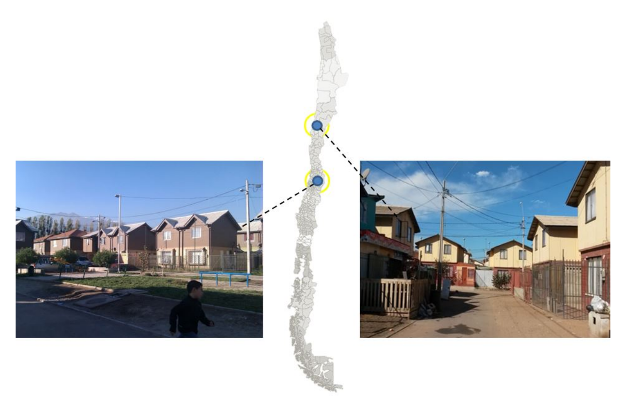
Figure 1: Location of Casas Viejas, Puente Alto, Santiago and Villa las Araucarias, IV Region, La Serena, 500 kilometres north of Santiago.

not change this situation. Rather, successive elected governments guaranteed this housing market specifically for low-income home ownership through different forms of subsidy. Within this urban segregation, Chile has one of the highest home ownership rates among OECD countries.