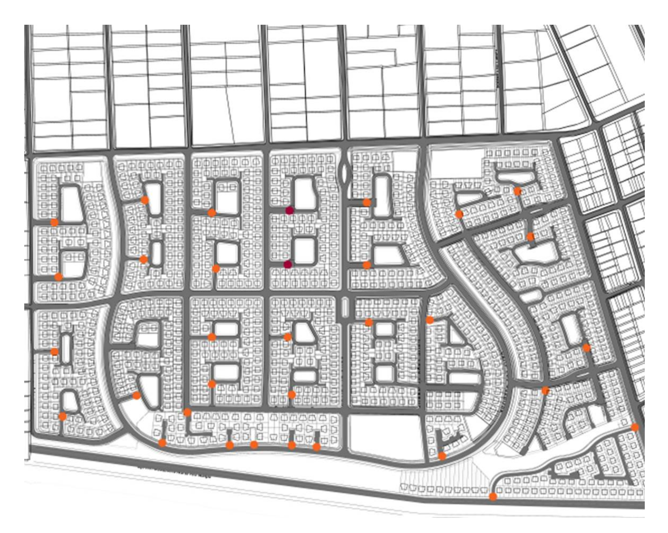
Figure 3: Site Plan showing the enclosed cul-de-sacs in Casas Viejas, Puente Alto, Santiago. (Authors)

For the team of students, this funded research afforded a real subject of enquiry and a link between the teaching at undergraduate level and as a transition to postgraduate studies and research. The research project engaged architectural students with communities outside both of those of the university and architecture.