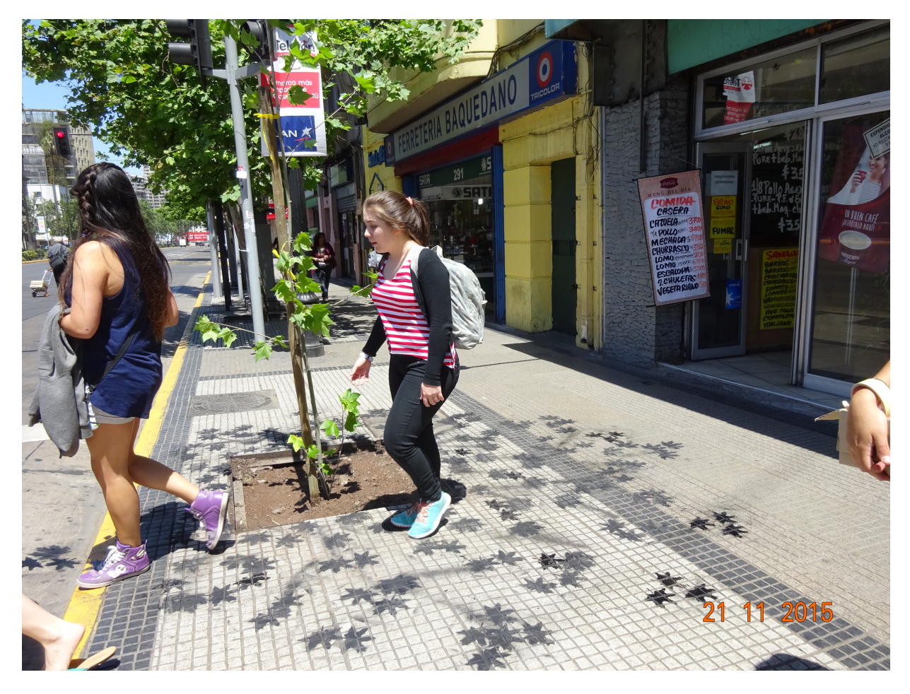
Figure 6: To Save a Tree. 100 en 1 Día Urban Intervention Festival. The painted shadows of the tree. Alameda Avenue, Santiago, Chile. (Authors)