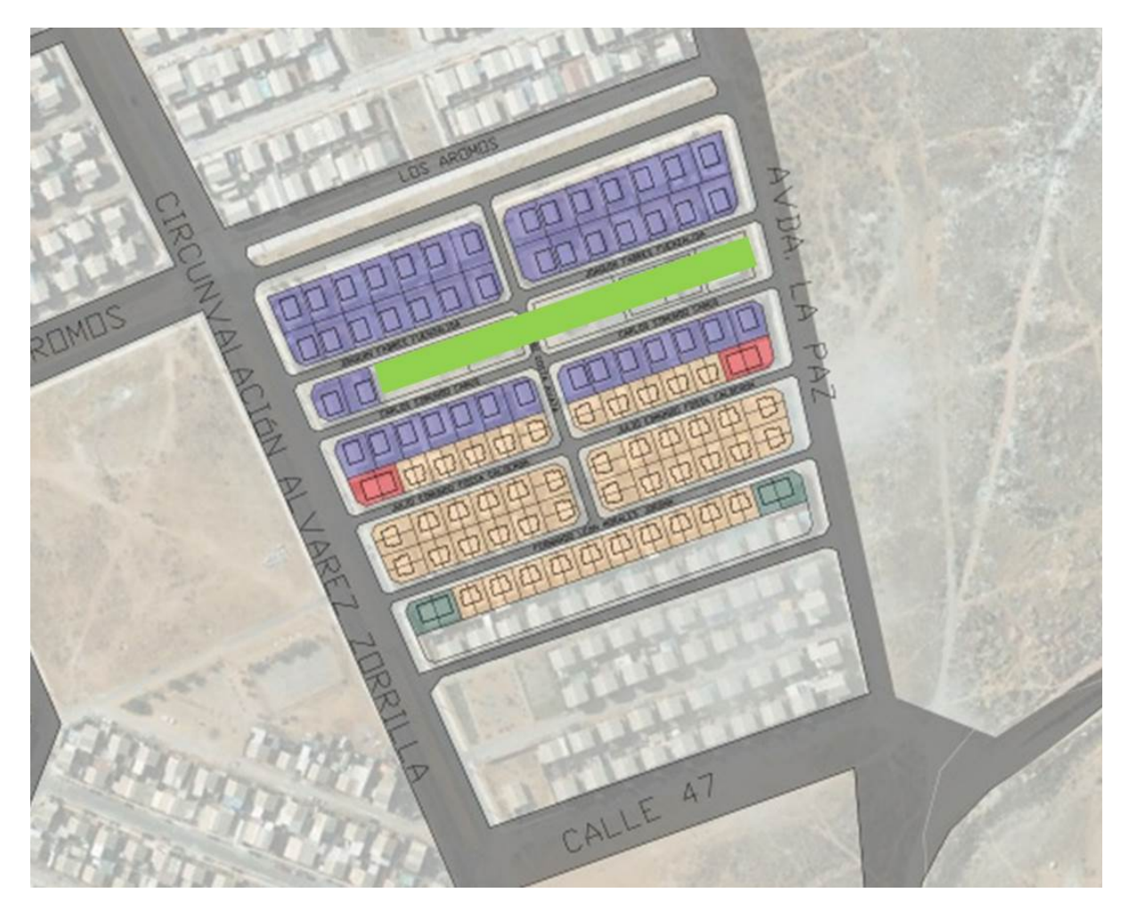
Figure 2: Site Plan showing the urban design with the two housing types segregated by open public space in Villa las Araucarias, La Serena. (Authors)

The information produced through this teaching informed a central tenet of the research. These surveys, assessments, analyses and audits revealed a conflict between the policy objective of social integration and its implementation through the design and construction of Socially Integrated Housing projects. This conflict was evidenced in both SIH projects in their urban location and the urban and housing design. The central conclusion drawn from the teaching/research process was that the SIH projects had created a new typology of segregation. A first form of segregation was created by the peripheral location and poor transport connectivity. A second form of segregation was created by the urban design of Villa las Araucarias that divided the housing project into the two housing types by an open public space. In Casas Viejas, residents enclosed the public urban space excluding themselves and these public spaces from the remainder of the estate (Figure 2 and Figure 3).