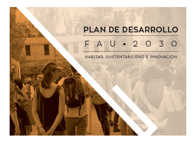
Figure 8: Cover of PD FAU 2030 showing the 3 strategic priorities. (FAU)

the emerging global architectural and urban design problems.