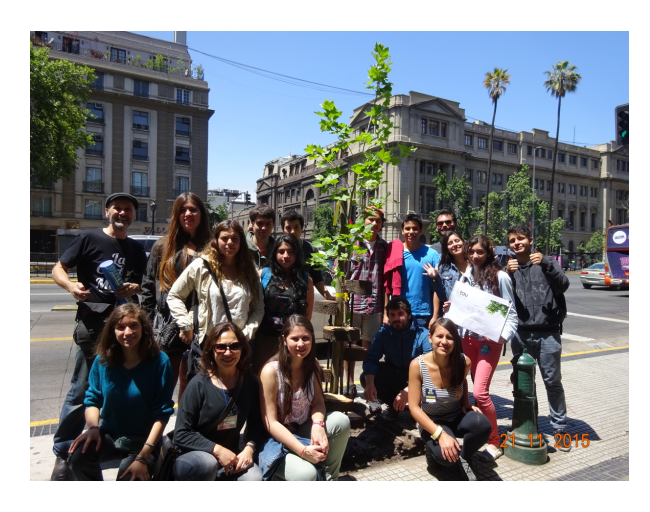
Figure 7: Academics and students after the installation of what was then thought to be a temporary intervention. (Authors)