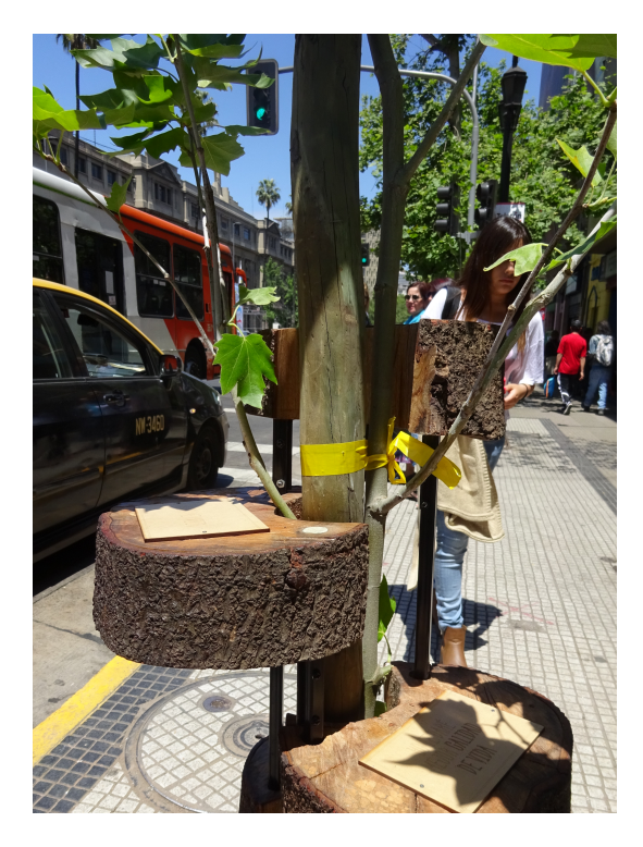
Figure 5: To Save a Tree. 100 en 1 Día Urban Intervention Festival. Installation view. Alameda Avenue, Santiago, Chile

At the time of writing, the intervention, originally proposed for a one-day festival, has been in site since November 2015 as has the growing tree it protects. While the painted shadow of the second tree has faded underfoot and this tree destroyed several times, 'To Save a Tree' remains as an unsanctioned permanent intervention in the main street of Santiago (Figure 7).