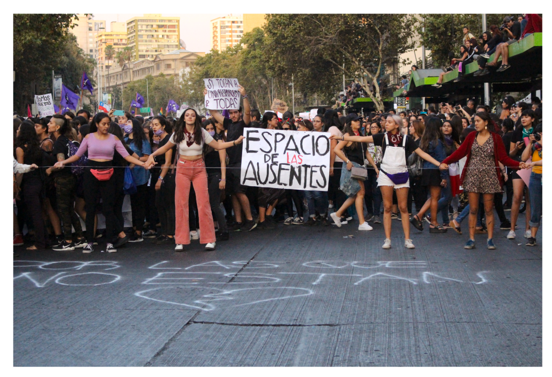
Fig. 1. Espacio de las ausentes intervention, March 8, 2018.

The scarcity and simplicity of a text used in this setting can be seen as an intervention that seeks to avoid the delivery of an explicit, unambiguous and stable meaning and that, rather, intends to become a sort of irritation or interference (LaBelle, 2019). In turn, the text unleashes and makes visible, not stabilised meanings, but potentials of action and