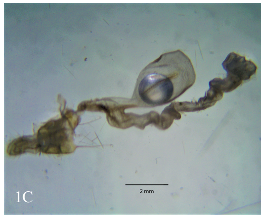
Figures 1A-1C. Helicoverpa titicacae . 1A. Male adult. 1B. Male genitalia. 1C. Female genitalia.