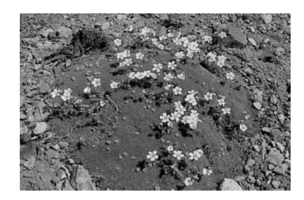
Fig. 1 An Azorella monantha cushion invaded by flowering individuals (white flowers) of Cerastium arvense.

We have tested the above hypothesis by documenting the extent to which a high-Andean ecosystem engineer, the native cushion plant ( Azorella monantha Clos.; Apiaceae; Fig. 1), affects the performance and survival of two common exotic forbs, field chickweed ( Cerastium arvense L.; Caryophyllaceae) and common dandelion ( Taraxacum officinale (L) Weber; Asteraceae), along an elevation gradient in the high-Andes of central Chile. High-mountain ecosystems represent an ideal system to test our hypothesis because current global change simulation models predict these ecosystems are particularly resistant to biological invasions due to their extreme environmental conditions when