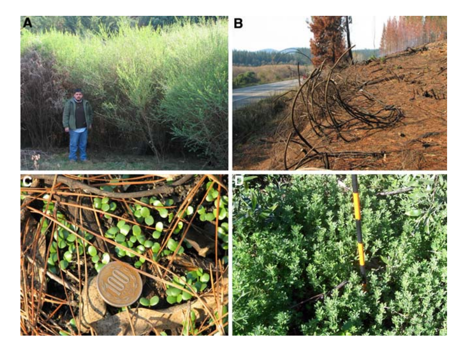
Fig. 1 Teline monspessulana interaction with fire. (A) Monotypic adult stand, (B) Post-fire condition, (C) Regeneration two months after fire (April), (D) Regeneration in mid-spring (October)

We sampled the abundance of T. monspessulana using 1 m<sup>2</sup> circular plots. A total of 45 plots were randomly distributed in each condition. Height of each T. monspesulanna plant was recorded in 10 cm height classes in each plot. We estimated living biomass in pure stands and underneath Eucalyptus plantations using biomass functions based on height and collar diameter (CD). Linear functions