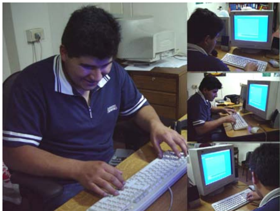
Fig. 1. A blind learner programming with APL

Two major difficulties can be found when blind learners use these languages. First, if they use a pure language they face the issue of verifying the program consistency and the correct reading of command lines. Second, if we provide them current tools to support program construction, they deal with graphical user interfaces. APL intends to close the gap between programming by sighted learners and programming by blind learners.