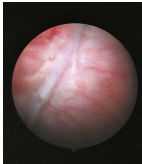
Fig. 5 Endoscopic image showing the line of staples covered by intestinal mucosa.

The purpose of an orthotopic neobladder is to endeavor to give the patient the best quality of life possible by trying to provide a continent reservoir, appropriate voiding