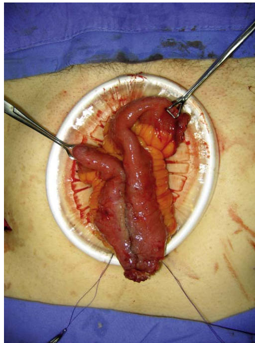
Fig. 2 Neobladder shape after placement of two to three lines of staples.

The surgery is completed by performing laparoscopic urethro-neobladder anastomosis by applying 3.0 polyglactin