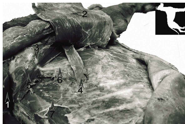
Fig. 1. Left side of the dog. M. trapezius (1). M. latissimus dorsi (2). M. teres mayor (3). M. latissimus dorsi second venter (4). M. rhomboideus thoracis (5). M. serratus ventralis caudalis (6). M. serratus dorsalis cranialis (7).

Each extra head is a flat thin muscle, lies on the dorsal half of the lateral thoracic wall, and it is covered to M. latissimus dorsi normal head. It begins from the spinous processes of six to eight thoracic vertebra, by mean a wide tendinous leaf of the lumbodorsal fascia, joint to the tendinous leaf of M. latissimus dorsi normal head (Fig. 1).