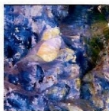
THE ANDES, NORTH CHILE. NASA USGS Front cover, Back cover, and End papers.