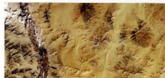
SAN JOSÉ MINE, NORTH CHILE. NASA USGS. Pages: 34 - 45