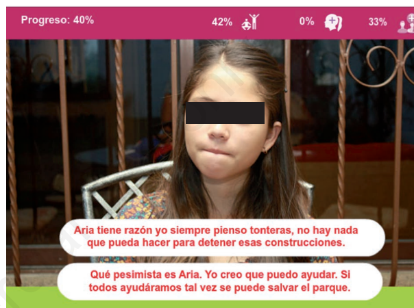
Figure 1. Screenshot of a video game scene. Aria is a friend of Maya, who criticizes her intention of supporting the social movement to stop the destruction of the park. This scene presents two options to the player. The phrase on top reads: Aria is right, I always think dumb things, there is nothing that I can do to stop those constructions. The phrase in the bottom reads: Aria is very pessimistic. I think that I can help. If everyone would help maybe the park can be saved. The bar on the top presents the progress in the game and the score for the three areas that the game explores: behavioral activation and healthy living; recognition and modification of negative cognitive bias; promotion of interpersonal skills and interpersonal problem solving.

Interview data was analyzed using qualitative content analysis techniques. Qualitative content analysis seeks to classify the data in the form of text into categories that represent similar meanings. According to Hsieh and Shannon (2005), qualitative content analysis can be defined as a research method for the subjective interpretation of the content of text data through the systematic classification