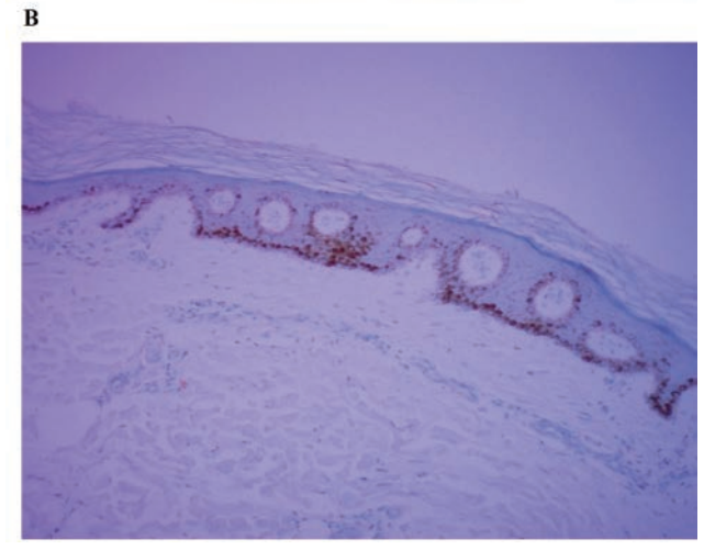
Figure 3. A) Skin biopsy of the lentigines, exhibiting increased melanin deposition in the basal epidermal layer, acantosis and joined papillae (hematoxylin and eosin, original magnification, x 40); B) Immunohistochemical analysis, showing basal melanine deposition and a normal melanocyte count. (HMB45, original magnification, x 40).