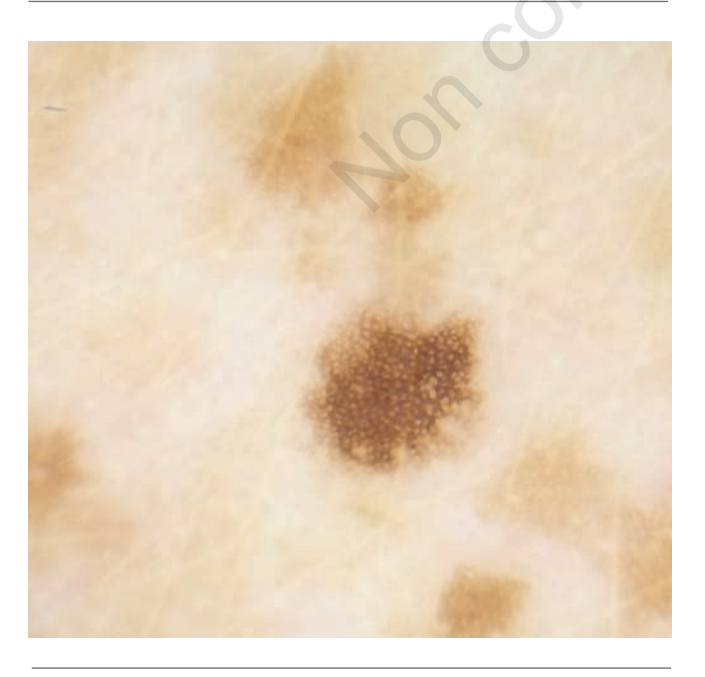
Figure 2. Dermoscopy of the lentiginous eruption, showing a regular reticular pattern consistent with lentigo