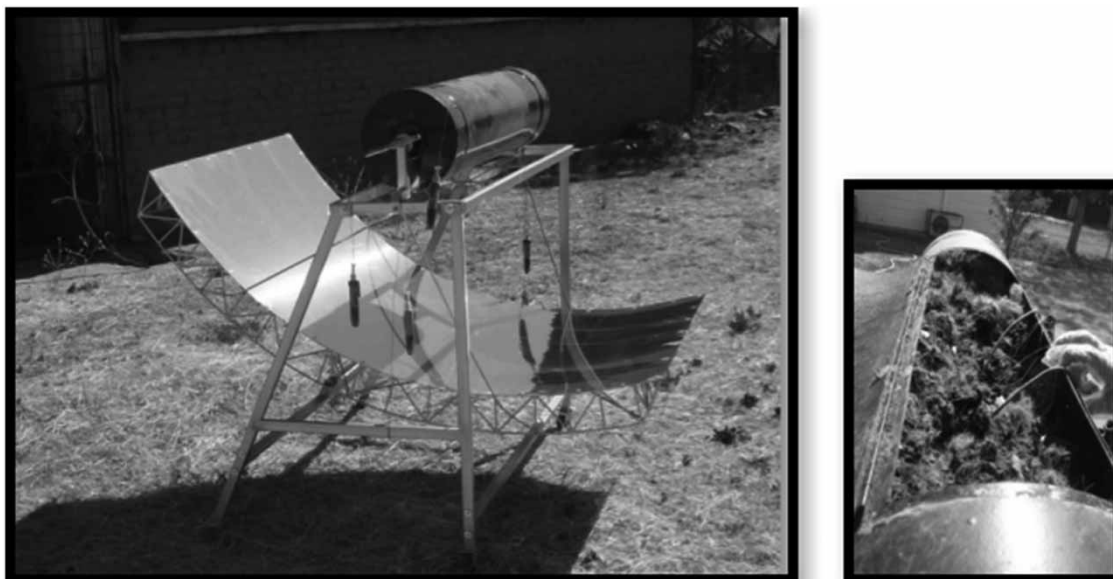
Figure 1 | Left: Solar concentrator with 50 L drum and temperature probes. Right: 50 L drum with radial door, loaded with feces, tea bags, and temperature probes.

Dog and horse feces were placed into a 30-cm deep hole that was dug next to the solar concentrator. Temperature probes and tea bags were placed in the middle of the mimic pit latrine and an aluminum sheet was placed over the pit to simulate conditions for pathogen inactivation.