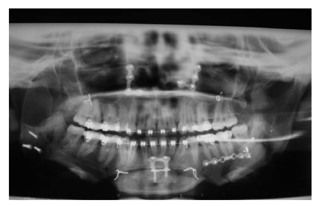
Fig. 14. Reconstruction of right mandibular ramus with iliac crest graft and orthognathic surgery at the same time (patient 6). Panoramic x-rays: 3 years post surgery.

to undertake orthognathic surgery, operating on the mandible first<sup>10,11</sup> (Figs. 11–21).