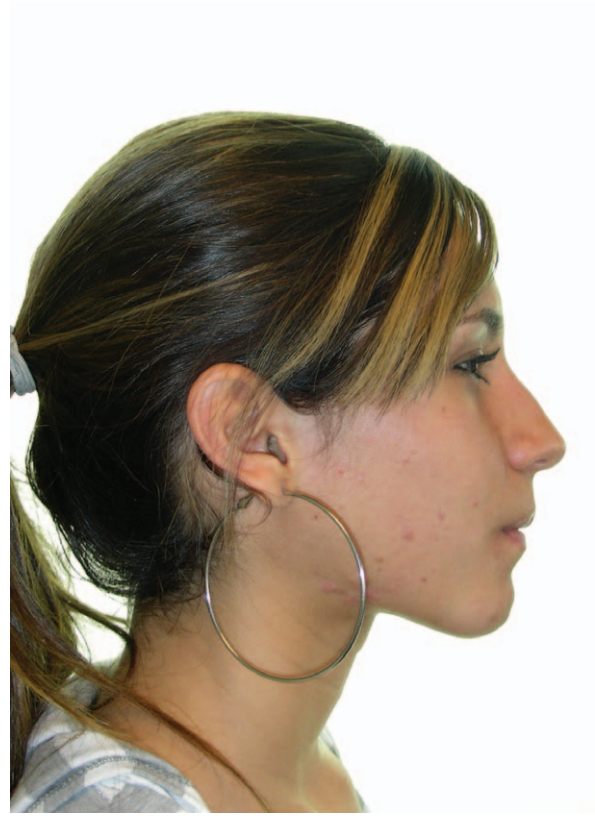
Fig. 13. Reconstruction of right mandibular ramus with iliac crest graft and orthognathic surgery at the same time (patient 6). Profile facial photograph: 3 years post surgery.

3. Reconstruction of mandibular ramus and orthognathic surgery in one surgical time: If the mandibular ramus remainder is insufficient for undertaking MDO (MIIB, MIII) after craniofacial growth has concluded, orthognathic surgery is undertaken at the same time as reconstruction of the TMJ and the compromised mandibular ramus, using a free graft of the iliac crest, an articular TMJ prosthesis or a fibula free flap.<sup>9</sup> In these cases, planning requires double mounting of the upper maxilla