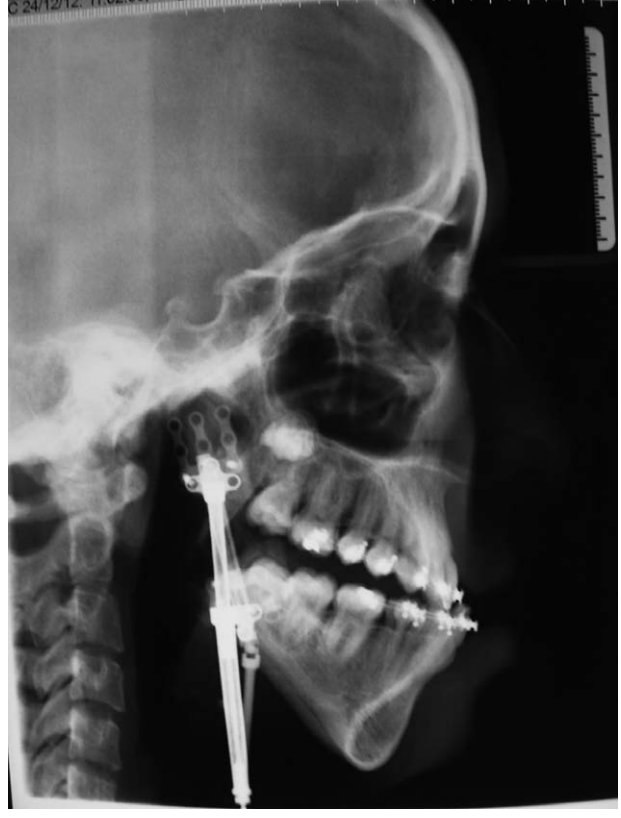
Fig. 8. Bilateral mandibular distraction osteogenesis and deferred Lefort I osteotomy, genioplasty, and rhinoplasty (patient 5). Lateral x-ray: at the end of bilateral MDO.

IIB CFMs require orthopedic treatment to stimulate mandibular growth and to prevent maxillary dentoalveolar compensations.<sup>1</sup> For mixed dentition, in type I and IIA cases, early vertical mandibular elongation might be needed. Cases IIB and III require