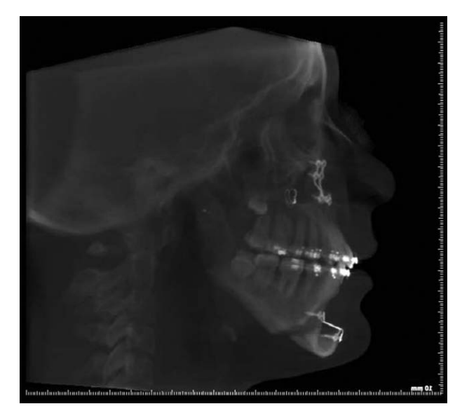
Fig. 9. Bilateral mandibular distraction osteogenesis and deferred Lefort I osteotomy, genioplasty, and rhinoplasty (patient 5). Lateral x-ray: 1 year post surgery.

reconstruction of the TMJ with a costochondral graft or of the iliac crest.