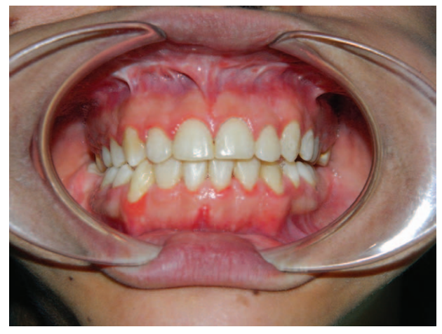
Fig. 6. Bilateral mandibular distraction osteogenesis and deferred Lefort I osteotomy, genioplasty, and rhinoplasty (patient 5). Occlusal photograph: 1 year post surgery.