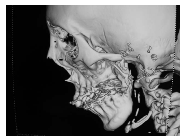
Fig. 19. Reconstruction of left mandibular ramus with iliac crest graft and orthognathic surgery at the same time (patient 7). Computed tomography scan: before surgery.