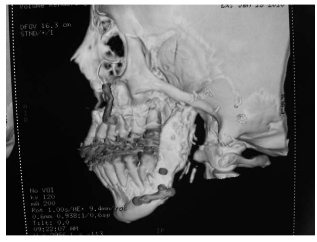
Fig. 20. Reconstruction of left mandibular ramus with iliac crest graft and orthognathic surgery at the same time (patient 7). Computed tomography scan: 4 years post surgery.

causes secondary skeletal alterations that can be avoided or reduced with early reconstruction of the mandible.