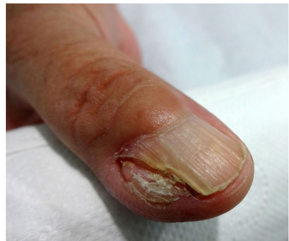
Figure 1 Clinical photograph of the keratoacanthoma. The nodular, skin-colored lesion affected the proximal and ulnar borders of the nail and periungual region of the right thumb.

Color Doppler ultrasound was requested. The report described a solid, hypoechoic tumor with a center of lower echogenicity and of solid appearance, located at the ulnar border of the periungual region and extending into the nail bed on the same side; the ultrasound appearance was not suggestive of malignancy. The lesion measured 11 mm (transverse) × 10.7 mm (longitudinal) × 8.3 mm (depth). Vascularization was predominantly peripheral, in the form of narrow vessels with low-velocity arterial flow, and there was remodeling of the surface of the underlying distal phalanx. In addition, signs of inflammatory (hypervascularity) were