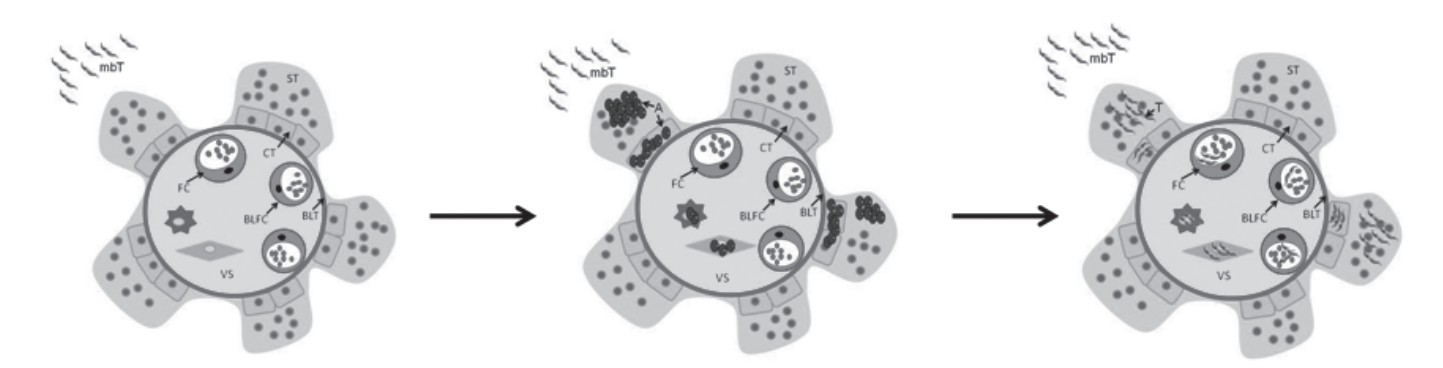
Figure 2: Probable mechanism of congenital transmission of T. cruzi : During congenital transmission maternal blood tripomastigotes (mbT) must cross the placental barrier. We propose that the maternal blood tripomastigotes in the placental intervillous space infects syncytiotrophoblast (ST), cytotrophoblast (CT) and Villous stroma (VS) invading the different types of cells that constitutes these tissues. In the interior of these cells and in the syncytiotrophoblast the trypomastigotes differentiate into amastigotes (A), proliferate and after a certain number of replication the amastigotes differentiates again into trypomastigotes (T) which could invade the fetal capillary and in this way infect the fetus.

human placental cells is of particular importance. Additionally, the possibility to study possible antiparasitic mechanisms in this tissue may allow development of new therapeutic and preventive strategies. Last but not least, this model may be useful to study the effect and toxicity of antichagasic drugs.