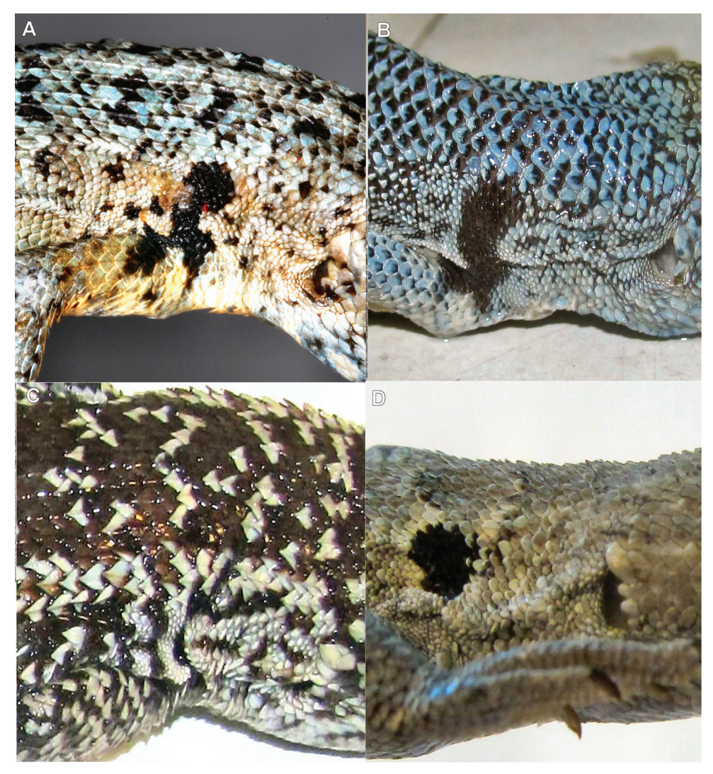
Figure 4. Lateral shoulder view of some specimens studied. A Holotype of Liolaemus nigromaculatus (ZMB 613, juvenile male) with black "λ" shaped antehumeral spot and dorsal scales without mucrons B Holotype of Liolaemus bisignatus (= L. nigromaculatus , adult male MNHN-CL 1477) with black "λ" shaped antehumeral spot and dorsal scales without mucrons C Male specimen of Liolaemus zapallarensis (MZUC 29118) with irregular antehumeral spot and dorsal scales with mucrons D Male specimen of Liolaemus atacamensis (SSUC Re 469) with rounded antehumeral spot and dorsal scales without mucrons.

scales. The temporal band has seven dark spots, which are smaller than the spots over the paravertebral fields. There is a marked, black antehumeral spot from the shoulder to the humeral zone which shows a constriction in the middle and is divided into two at the base, as forming a " \lambda " shape (Fig. 4). Forelimbs and hindlimbs have a gray-brown color and black spots. Flanks are of a gray-brown color. The tail has a brown color and few dark