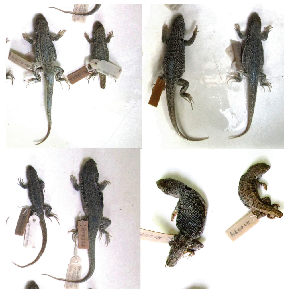
Figure 5. Some specimens listed by Troncoso and Ortiz (1987). All are assignable to Liolaemus nigromaculatus , from top left to bottom right: MRC 274 and 226 ( L. nigromaculatus from Huasco), MRC 282 ( L. nigromaculatus from Caldera), MRC 276 ( L. bisignatus from Caldera), MRC 225 ( L. nigromaculatus from Huasco), MRC 272 ( L. bisignatus from Huasco), and MRC 090 and 094 ( L. copiapoensis from Copiapó).

to as L. bisignatus should be referred to as L. nigromaculatus based on the following: 1) Of the species in the nigromaculatus group that have the nasal separated from the rostral, only L. bisignatus and L. atacamensis (Figs 6, 7) have dorsal scales without mucrons, and of these, only L. bisignatus overlaps with the diagnostic characters of L. nigromaculatus , 2) The color of the L. nigromaculatus holotype is brown-gray with a series of black spots over the paravertebral fields, as in juveniles of L. bisignatus , 3) L. nigromaculatus has a black" \lambda " shaped antehumeral spot, from the shoulder to the humeral zone, like L. bisignatus , 5) L. nigromaculatus has abundant black spotted scales on the dorsum, like L. bisignatus , 6) The holotype of L. nigromaculatus has at least 80 ventral scales, which is