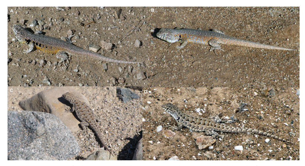
Figure 6. Variation of color pattern in Liolaemus nigromaculatus . A and B Adult males from 20 Km SE from Puerto Viejo C Adult female from the same location D Juvenile from Caldera.

in the range of L. bisignatus but not for L. atacamensis (Table 1), 7) Of the species in the nigromaculatus group with the nasal separated from the rostral, only L. bisignatus and L. atacamensis are known to be from the zone in which Meyen collected the holotype of L. nigromaculatus (see below), and of these only L. bisignatus overlaps with the diagnostic characteristics of L. nigromaculatus , 8) In Huasco, the location currently accepted as the type locality of L. nigromaculatus , it is only possible to find two other species of Liolaemus ( L. bisignatus and L. fuscus ), this explains why Müller and Hellmich (1933a) assigned Huasco as the type locality of L. nigromaculatus . In contrast to L. nigromaculatus , L. fuscus has the nasal scale always in contact with the rostral.