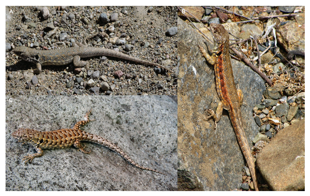
Figure 7. Variation of color pattern in Liolaemus atacamensis . A Adult male from El Trapiche B Adult male from Lomas de Buitre C Adult female from Lomas de Buitre.

ings (e.g. Tierra Amarilla, El Checo mine). Ten days later, he returned to Puerto Viejo and sailed to Peru. Meyen's journey is also detailed in Domeyko (1859).