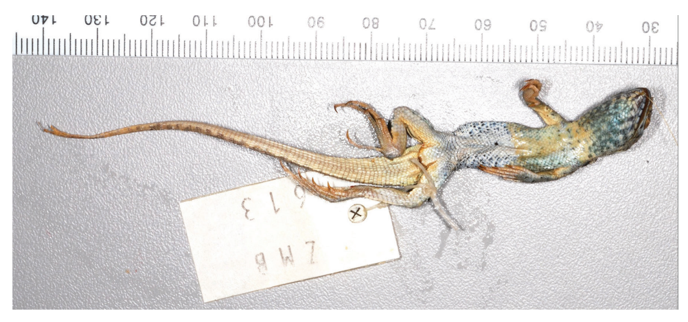
Figure 3. Ventral view of the Liolaemus nigromaculatus holotype (ZMB 613).

fold is present. Six temporal scales between the level of the supercilliaries and commissure. Dorsal scales are rounded or lanceolated, imbricated, slightly keeled, and without mucrons. Ventral scales are rounded, smooth, and subimbricated. There are at least 80 ventral scales and three precloacal pores, two according to Müller and Hellmich (1933a). Dorsal scales of the tail are rounded, imbricated, keeled, and mucronate.