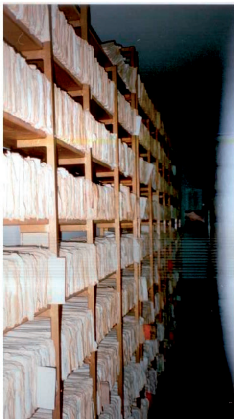
Figure 1 Paediatric clinical records in the local hospital

area was low so that we would be able to find most participants born in the 1970s still living in Limache and in Olmué, a neighbouring area.