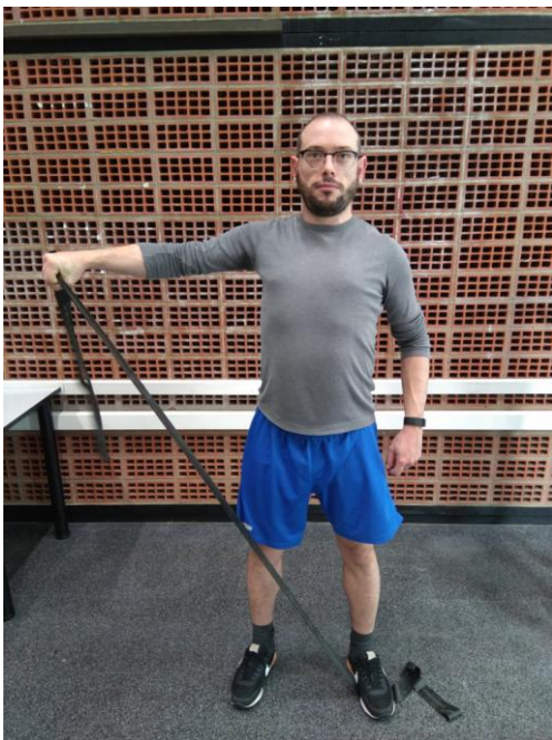
Figure 1. Illustrative example of the 2 exercises performed with elastic resistance: 1a and 1b show the initial/final phases of the elbow flexion exercise, whereas 1c and 1d show the initial/final phase of the shoulder abduction exercise.