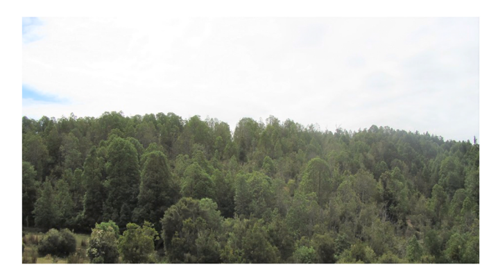
Fig. 4. El Monte, a successional forest dominated by thin saplings of Canelo (Drimys winteri).

Indeed, unlike el monte, the timber plantations of el bosque, grow rapidly. These manicured monocultures are neatly arranged in straight lines and clear-cut every ten to twenty years (Fig. 5). El bosque is also a complex and ambivalent representational space—explicitly understood to be the culprit for socioecological ruination, it is responsible for the destruction of roads, watersheds, wildlife habitats, and communities. At the same time, occasional company contracts and odd jobs were valued—especially when crop prices were low, or crops failed, and in times of financial emergency. Cutting a metro ruma (cubic meter of eucalyptus or pine) was a relatively easy means to obtain much needed cash. When finished, farmers stacked their wood near the road where buyers would occasionally pick them up. Exotic timber, unlike native forest fragments, was a much more efficient source of liquidity in hard times. This feature is important when considering the precarious state of the Chilean social security system. Elderly pensions barely cover basic needs, and the dual (private/public) systems of health and education are highly segregated. Thus, when a family member falls ill, access to money is often a matter of life and death (Han, 2012). Indeed, the lack of a social security system in