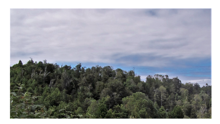
Fig. 2. A Montaña landscape. La Montaña is a heterogeneous canopy of multiple species.

with them through forest patches, they readily identified species used for food, medicine, and fuel. They told us that la montaña was home to diverse fauna, even mountain lions ( Puma concolor ).