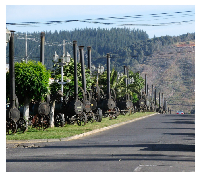
Fig. 1. Ransomes carcasses in the main street of a nearby town.

Since the 1990s, the time when neoliberalism became the hegemonic global model, the influence of the state has grown notably in Nahuelco. Due to the geographical isolation of Nahuelco, the land reform program (circa 1970) was short-lived in this location, and only reached productive soils located along fertile plains near the rivers, some 30 km away in today's roads. Previously, the state had remained generally absent from daily life in mountainous areas. For example, we were told about intense winters in the 1980s, when heavy snowfall and rain blocked the paths peasants used. To prevent hunger, older residents remember the military sending in helicopters with food and supplies. Rural electrification only