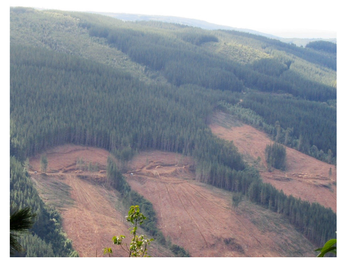
Fig. 5. El bosque consists of tree lines of Pine plantations planted in large continuous extensions.