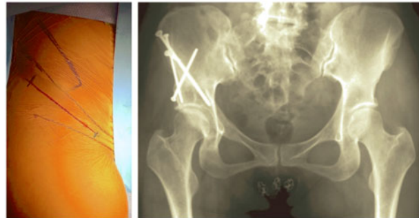
Fig. 1. Modified Ganz periacetabular osteotomy.

presence of cysts, chondral damage in the acetabulum and femoral head and ligamentum teres tears according International Cartilage Repair Society classification. All the images were evaluated by three musculoskeletal radiologists. Patients reported outcome scores, including the overall satisfaction and Harris Hip Score (HHS), were obtaining in all the patients before the surgery and at the last follow-up. The intra-class correlation coefficient with 95% confidence interval was used to measure the inter-observer and intra-observer agreements. The observer agreement was considered substantial for all the parameters evaluated. The survivorship was analysed by Kaplan–Meier curve. Data analysis was performed with SPSS (v21; IBM Corp). Institutional review board approval was obtained before this study began.