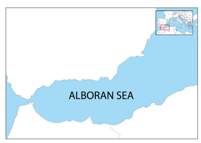
Fig. 1: Map of the Northern Alboran Sea (Geographical Subarea 1 according to General Fisheries Commission for the Mediterranean, GFCM division.).

Total length (TL, cm) from the tip of the snout to the tip of the longer lobe of the caudal fin was recorded by a measuring board. Total body weight (TBW, g), liver weight (LW, g), digestive weight (DW, g) and fillet weight (FW, g) were recorded using a balance to the