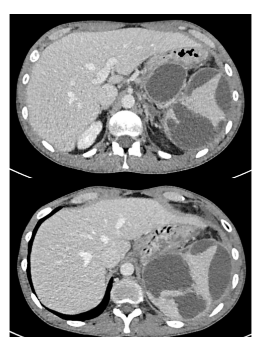
Figure 1: Pancreatic pseudocyst associated with intrasplenic extension and rupture with subcapsular hematoma.

Due to patient stability, conservative management was decided. This included analgesics, antibiotics and nutritional optimization. During the first 48 h, the patient was stable, with little pain and without fever. On the fourth day of hospitalization, he developed tachycardia and severe pain. The abdominal examination showed signs of peritoneal irritation and laboratory tests with a white cell count of 41 \times 10^9/L . Ultrasound assessment showed diffuse abdominal free fluid. An emergency laparotomy was performed, finding 1.5 L of dark serohematic and purulent fluid in the peritoneal cavity. The amylase level of this fluid was 3000 U/L. A large pancreatic tail pseudocyst was identified in addition to abundant clots in the left subphrenic space because of a ruptured spleen (Fig. 2). Due to extensive peripancreatic inflammation, dissection was difficult. Splenectomy was performed, extracting the shattered splenic parenchyma (Fig. 3). The amylase level of pancreatic cystic fluid was 13 000 U/L, confirming the diagnosis of a pseudocyst. We performed a double layer hand-sewn gastrocystic anastomosis with silk 2.0. One drain was located close to the anastomosis and two in the splenic bed. The patient had a satisfactory recovery, with drains fluid amylase level in the normal range, and was discharged on the 11th postoperative day.