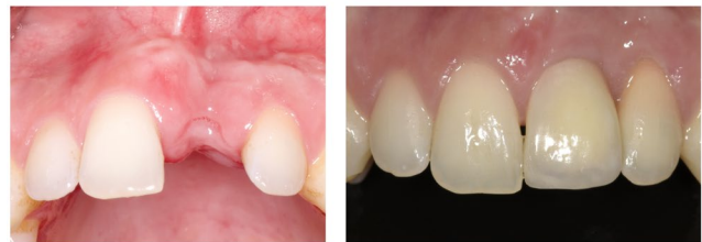
FIGURE 1 Representative cases of each treatment group; CM, PG and control group before implant placement and after 1 year of loading