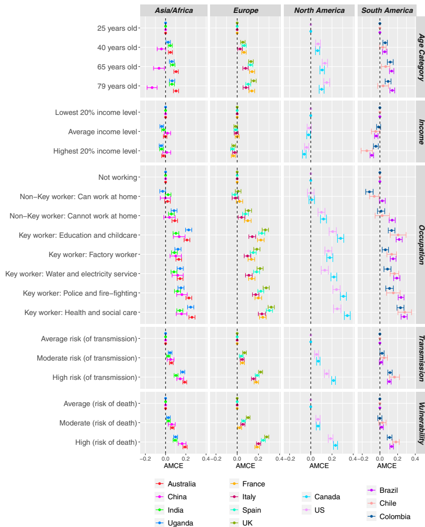
Fig. 2. Vaccine candidate decisions by country. AMCEs are reported for each attribute value. The 95% CIs are shown for each point estimate, clustered by subject. Models are weighted to reflect the respective national populations, excluding India and Uganda, which represent primarily urban samples.

correlations are suggestive; the public in weak-capacity states seem to be more enthusiastic about private provision than is the case in the higher-capacity states in our sample.