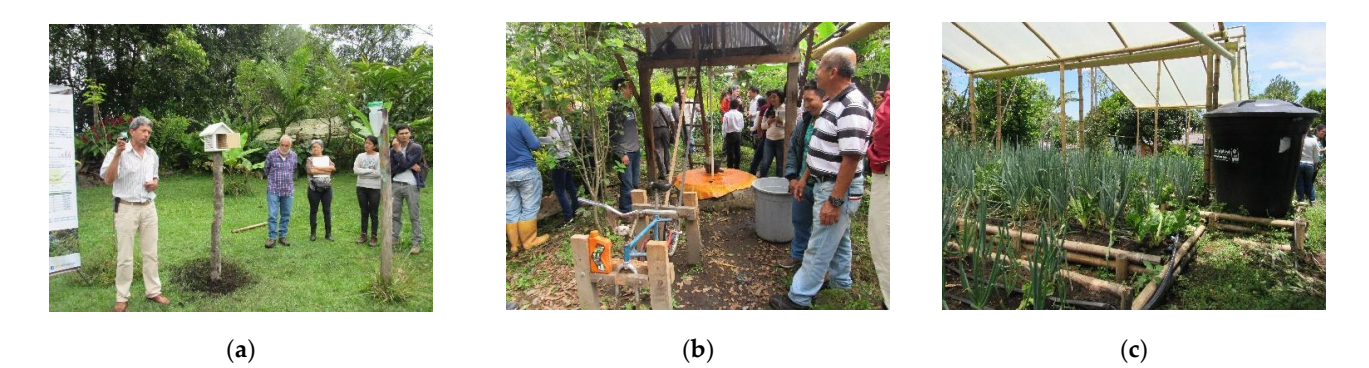
Figure 4. Various practices identified: meteorological station ( a ), ram pump to obtain water ( b ), and irrigation systems ( c ).

These are developed to promote food security. They have drip irrigation systems to maximize water usage. This practice allows self-production for daily sustenance and reduces dependency and expenses associated with buying food. It is also a good alternative for farms that have restricted space for cultivation. In addition, it is seen as an alternative for the permanent and sustainable generation of extra income for families. Examples of this are the production of vegetables and organic fertilizer in biofactories implemented on the same farms, which are marketed between farms and also in nearby urban organic markets such as Popayán. Figure 4 presents some of the practices described.