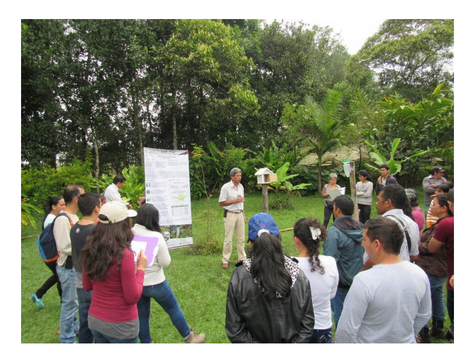
Figure 3. Meeting of farmers of the project farms.

and identify the resources, vulnerabilities, magnitude, and time scale in which they recognize there is an affectation. Based on this initial analysis, the families, with the support of local facilitators, define adequate short and medium-term adaptation measures to reduce the identified impacts (mainly droughts, rains, and winds), considering the costs of implementation and maintenance. The main short-term adaptation measures were smart water management and vertical house gardens, and the medium-term measures were generating smart weather and climate information and implementation of Farm-level Adaptation Plans which are described as follows.