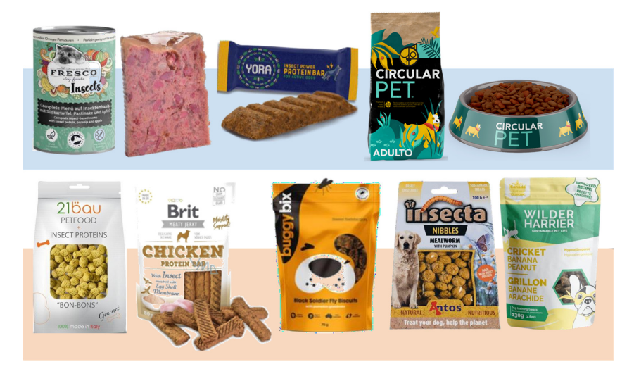
Figure 3. Examples of insect-based foods and treats for dogs and cats. Sources: Top row from left to right https://www.frescodog.co.uk/ (accessed on 26 April 2022); https://www.yorapetfoods.com/ (accessed on 26 April 2022); https://www.circular.pet/ (accessed on 26 April 2022). Bottom row from left to right https://21bites.com/ (accessed on 16 December 2021); https://brit-petfood.com/ (accessed on 26 April 2022); https://www.buggybix.com.au/ (accessed on 26 April 2022); https://www.antos.eu/ (accessed on 26 April 2022); https://www.wilderharrier.com/ (accessed on 26 April 2022); https://www.wilderharrier.com/ (accessed on 26 April 2022); https://www.wilderharrier.com/ (accessed on 26 April 2022); https://www.wilderharrier.com/ (accessed on 26 April 2022); https://www.wilderharrier.com/ (accessed on 26 April 2022); https://www.wilderharrier.com/ (accessed on 26 April 2022); https://www.wilderharrier.com/ (accessed on 26 April 2022); https://www.wilderharrier.com/ (accessed on 26 April 2022).

A wide variety of dog and cat foods based on black soldier fly larvae meal, mealworms and adult crickets are available in the marketplace; of all these insects, the most commonly used are black soldier fly larvae. Some are shown in Figure 3 and the industries that produce insect meal are outlined in Table 2.