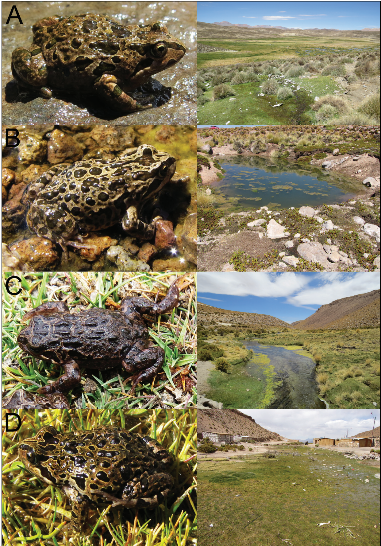
Figure 1. Specimens of Pleurodema marmoratum and their respective habitats. The localities sampled are as follows: A) Colpa, B) Ocahucho, C) Piga, and D) Coska.