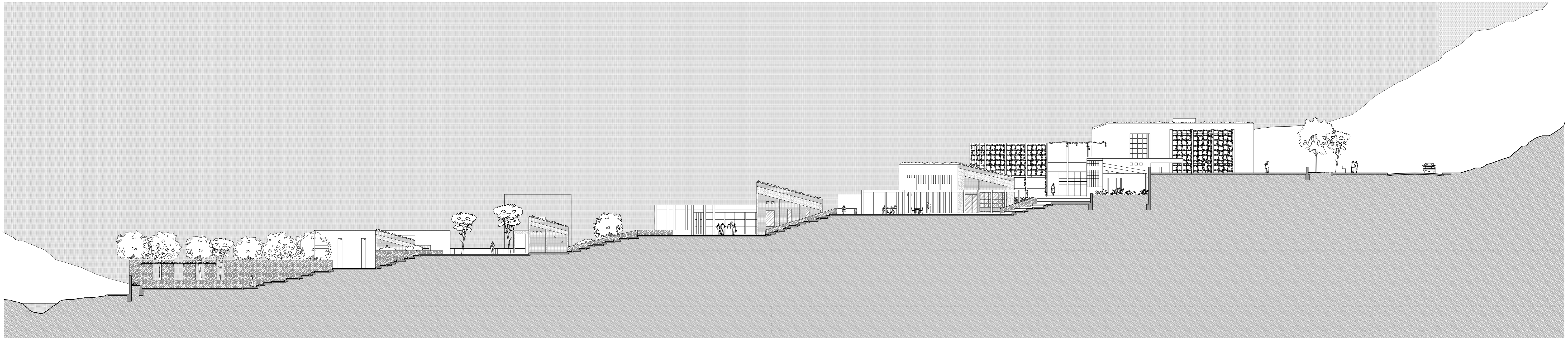
CORTE ELEVACION B-B'