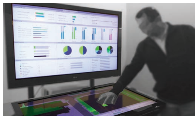
Figure 2: CLIM Tool. Multi-touch table and dashboard screen.

Campus Landscape Information Models allows direct collaboration among different disciplines by accessing real time information and evaluations on the screens, allowing for storage and retrieval of alternative designs as projects or sets of projects –or scenarios. CLIM was built specifically for our university campus, therefore the specific information about our university was used to construct the two fundamental models in which CLIM is founded: Information model and knowledge model (see figure 1). The information model was constructed directly from raw quantitative data, such as land use and tree inventory, while the Knowledge models were constructed from both expert and user knowledge, extracted from manuals, interviews, and surveys.