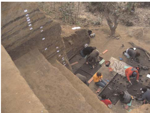
Figure 2 Photograph of the SJ site, showing archaeological excavation and stratigraphy. Note the abundant laminations of light-coloured sands and dark organic sediments at the base of the section. This figure is available in colour online at www.interscience.wiley.com/journal/jqs

Without local data, fire event calibration is difficult. Extrapolation from calibration studies obtained from temperate forests (e.g. Higuera et al. , 2005; Whitlock et al. , 2006, 2007; Carcaillet et al. , 2007) is not warranted, given that SJ lies within semiarid scrub with considerably less biomass. We thus utilise our charcoal record for visualising broad-scale relationships between fire/climate change/human activity rather than estimate individual fire events or local fire activity (Whitlock et al. , 2006; Higuera et al. , 2007).